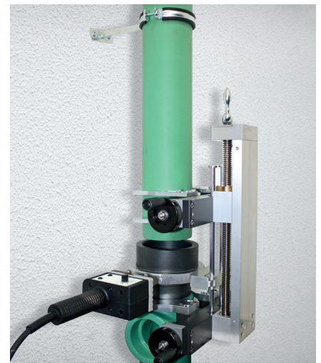
Vertical socket welding