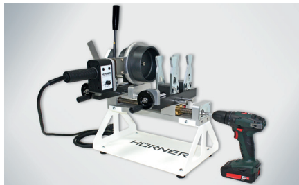
Power tool (drill / cordless screwdriver) optional